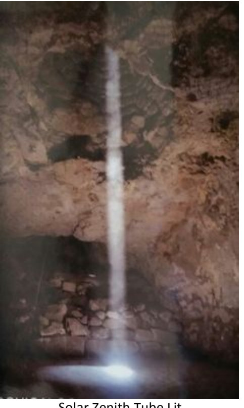
Solar Zenith Tube Lit on a Solar Zenith Day

Tuning into the magic and mystery that the Mayans clearly were tuning into can support our own dreaming and recognition of the emerging New Earth that values everyone and supports all life to live illuminated with peace and plenty.