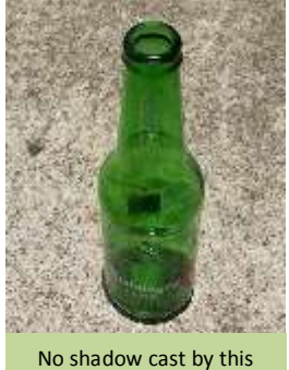
No shadow cast by this bottle at high noon when Sun is at Zenith.

Each year around May 20 in the current era - the Sun and Pleiades come together as they cross the Zenith point (meaning they are directly overhead) at 20 degrees North Latitude at high Noon.