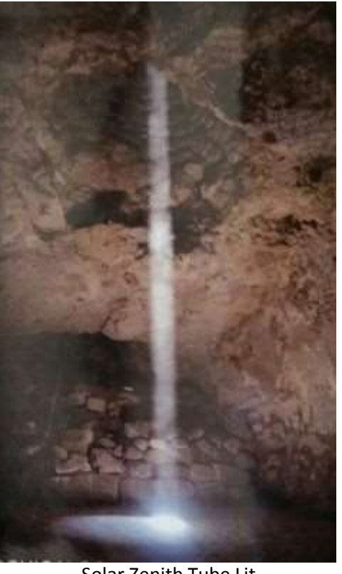
Solar Zenith Tube Lit on a Solar Zenith Day

Tuning into the magic and mystery that the Mayans clearly were tuning into can support our own dreaming and recognition of the emerging New Earth that values everyone and supports all life to live illuminated with peace and plenty.