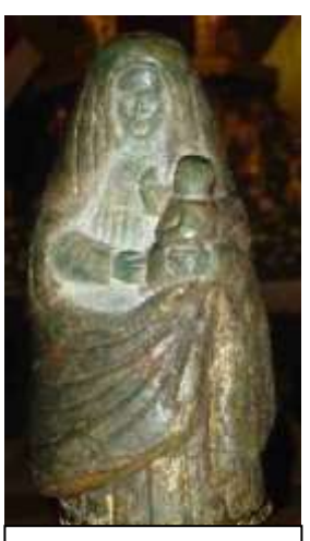
Above Nigrita and Child

It is an under reported fact how much the Black Madonna and Child is one of the most sacred icons of the Catholic Church. In Poland, believers are encouraged to pray to the Black Madonna of Czestochowa every morning before rising. In the June 11, 1979 issue of Time Magazine an article