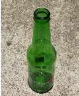
No shadow cast by this bottle at high noon when Sun is at Zenith.

Each year around May 20 in the current era - the Sun and Pleiades come together as they cross the Zenith point (meaning they are directly overhead) at 20 degrees North Latitude at high Noon.