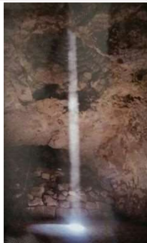
Solar Zenith Tube Lit on a Solar Zenith Day

Tuning into the magic and mystery that the Mayans clearly were tuning into can support our own dreaming and recognition of the emerging New Earth that values everyone and supports all life to live illuminated with peace and plenty.