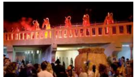
ALL Souls/Day of the Dead Celebration in Tucson, Arizona

November 1 is All Saints Day , a Roman Catholic observance honoring their Saints who reside in Heaven. Also in the Catholic tradition Nov 2 is All Souls Day reminding souls here to live a holy life and to pray for the souls lost in purgatory. In more ancient traditions Nov 2 honors the Dead though this day was not always fixated to November 2 but rather the New or Full Moon closest to the Samhain Cross-Quarter. In Mexico and many parts of the Western United States, the celebration of Dia de los Muertos (Day of the Dead) dates back at least 3,000 years and has even survived the Spanish Conquistadors attempts to eradicate this tradition over 500 years ago.